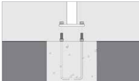
Base Plate Footing Design