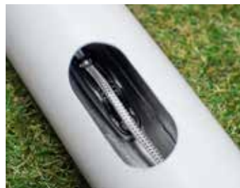
Available with Vandal-Resistant Internal Halyard