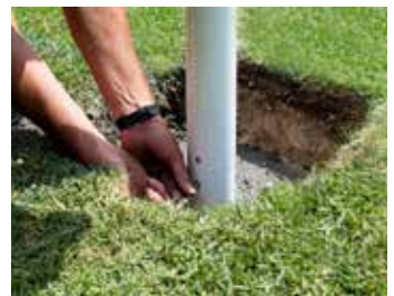
Secure Locking Available on Spigot Base Models