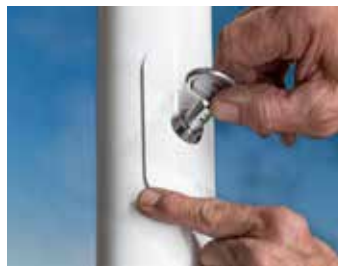
Lockable Aluminium Security Doors