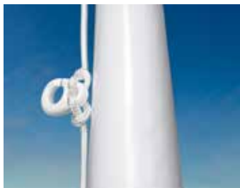
Quality Halyards and Fittings on all Abel Banner Poles